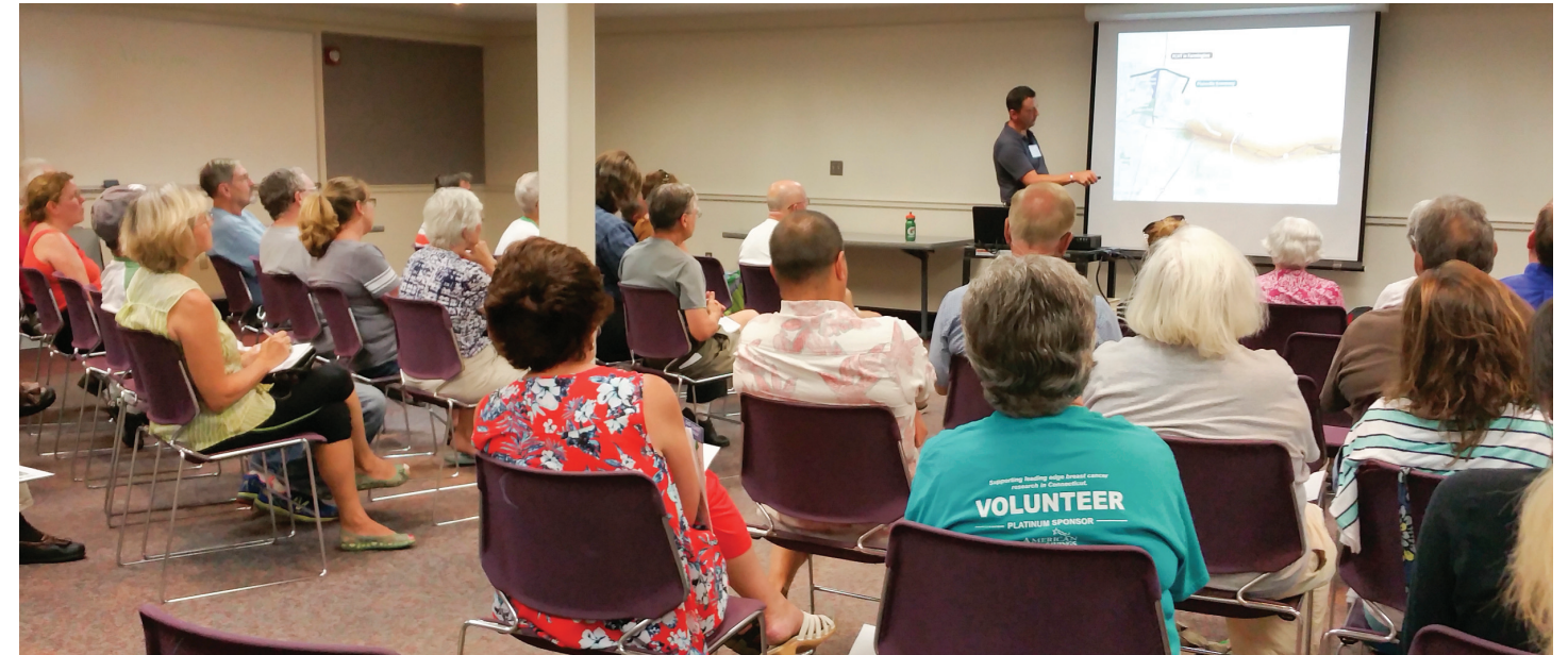
Public Informational Meeting - July 2016